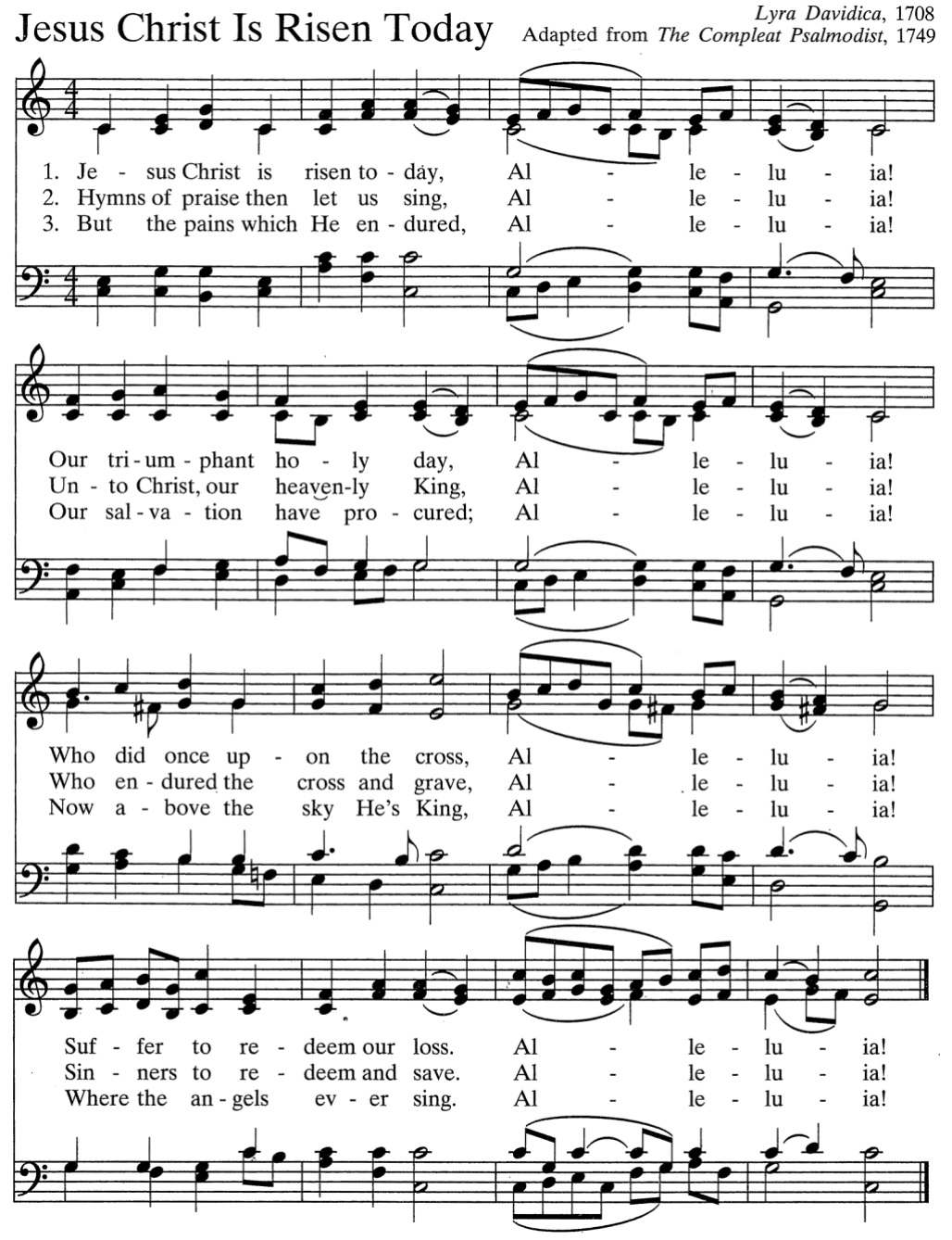
The Presbyterian Hymnal Copyright \mathbb C 1990 Westminster/John Knox Press